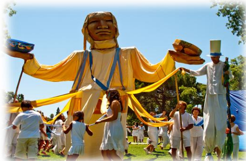
DeltaFusion's 2011 mascot, Votelta, and community members celebrate San Joaquin Valley's rich history