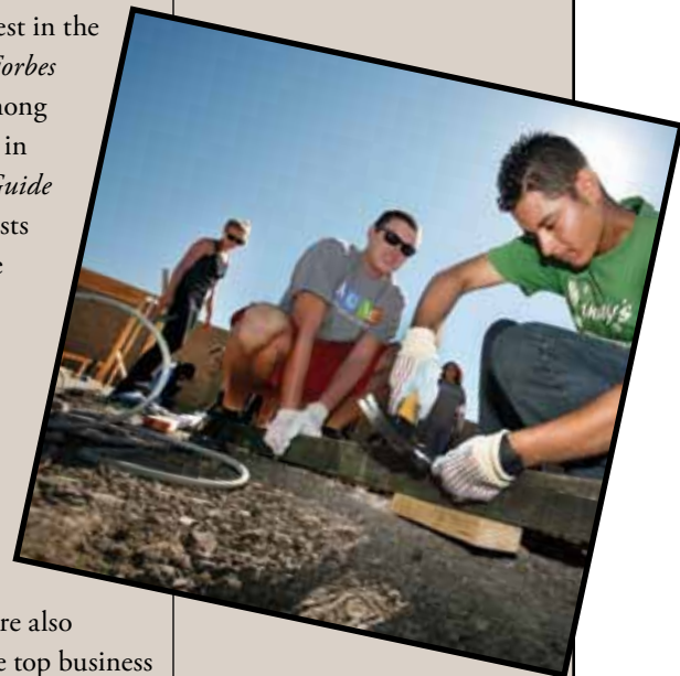
Pacific incoming freshmen help build a house with Habitat for Humanity during MOVE in August 2011.

Pacific also has been placed on the national President’s Higher Education Community Service Honor Roll for the last three years.